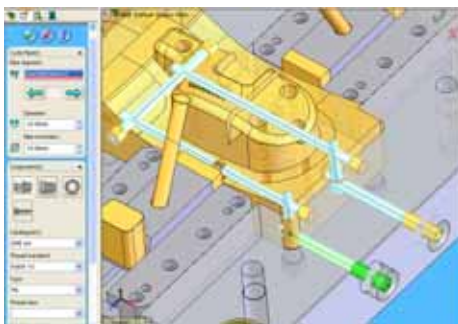
Heat Exchange Preview

Initial Mold Base Library creation includes inserts pocket and slider creation with automatic pre-estimation of the mold. You can choose the initial component options and visualize the exact standard or non-standard mold base before creating it with a click of a button. Equations and mates are added so that the mold retains its coherence throughout the mold design process. Advanced functionality allows you to customize the component options, the plate sizes and configurations according to your company standards.